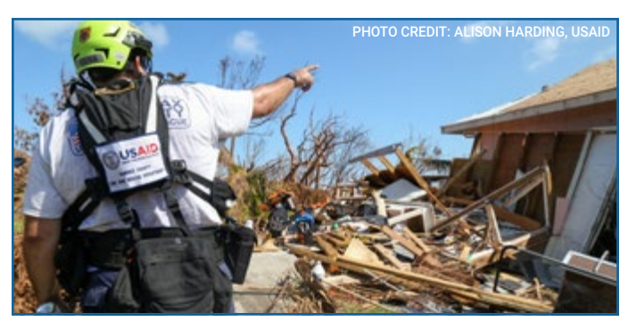
Following Hurricane Dorian, USAID deployed search and rescue members from Fairfax County Urban Search and Rescue. This team searched more than 1,000 houses and buildings and assessed structural damage to determine safe return.

Agencies that assisted included the U.S. Agency for International Development, U.S. Coast Guard, U.S. Customs and Border Protection, U.S. Northern Command (including the U.S. Air Force, U.S. Navy, U.S. Army and U.S. Marine Corps), ATF, Drug Enforcement Administration, the Federal Aviation Administration, the Federal Communications Commission, the U.S. Department of Commerce and other agencies. The Dorian relief effort was a massive collaborative effort to support the people of The Bahamas and the Bahamian government in the wake of the most powerful storm to ever make landfall on these islands. In the words that U.S. Chargé d'Affaires Stephanie Bowers shared when the relief effort began, "we have seen the true meaning of partnership."