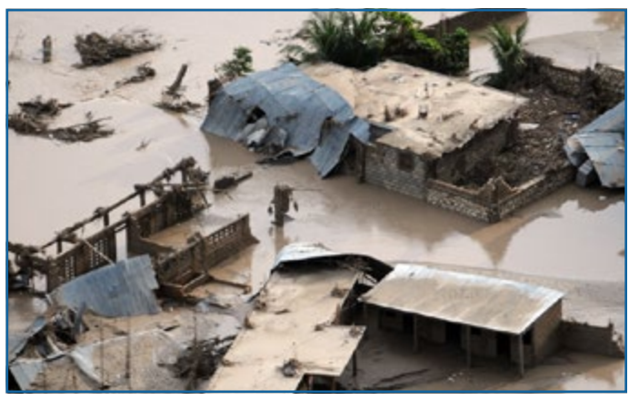
Aerial views show extent of hurricane damage in Haiti.

USAID and NOAA, in partnership with the Meteorological Services of Haiti and the Dominican Republic, is working to build local capacity and develop tools and products for forecasting storm surges. USAID will roll out storm-surge mapping to additional countries in the Caribbean, to enable governments to assess and mitigate flooding risks from hurricanes and tsunamis. In addition, USAID, in partnership with the U.S. Geological Survey (USGS) of the Department of the Interior, will offer technical assistance to the Seismic Research Center at the University of the West Indies' for Dominica and other Caribbean nations to build technical skills in monitoring volcanoes. This assistance will help Caribbean countries improve their ability to provide early warning.