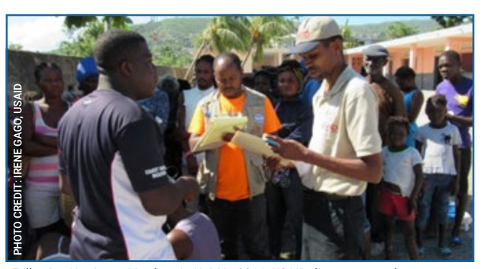
Following Hurricane Matthew in Haiti in 2016, USAID disaster consultants assessed the needs of families staying at a school in Grand'Anse Department to determine how USAID could best assist people displaced by the storm.

The U.S. government came together to rescue over 400 people, survey over 1,000 homes and buildings, transport enough metric tons of supplies to help 54,000 people, and assess air and seaports, schools, and bridges, in addition to supporting The Bahamas National Emergency Management Agency and other Bahamian government and law enforcement agencies, as well as local and international charitable organizations, and private companies on the ground.