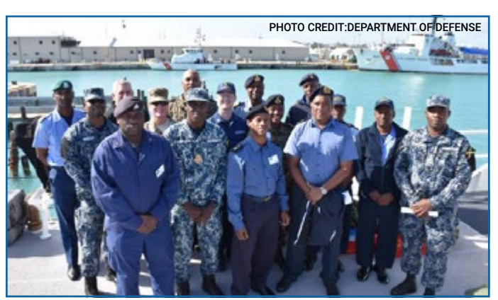
CBSI Partners gather for photo on U.S. Coast Guard Cutter William Trump.