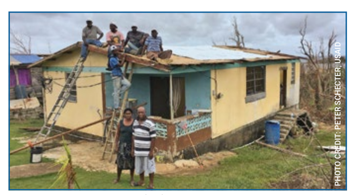
Working with U.S. Department of Defense's Southern Command, the USAID's Disaster Assistance Response Team led the U.S. response to the Caribbean hurricanes in 2017, rapidly delivered the plastic sheeting to thousands of families in need in Dominica.

One of the greatest challenges the Caribbean faces is vulnerability to natural disasters. In recognition of our shared interests in building better resilience and response capacity, on April 12, 2019 the U.S. invited the nations of the Caribbean to join in launching a U.S. Caribbean Resilience Partnership. This partnership brought together ten U.S. government agencies and eighteen Caribbean countries. The U.S. is fortunate to count the nations of the Caribbean among our friends who work with us to face the shared challenges from and impacts of disasters. Hurricanes, sea level change, flooding, earthquakes, and other threats can endanger lives, destroy property, and undermine economic and political advances in the areas highlighted in the pillars of the U.S.-Caribbean 2020 Strategy. This partnership provides a means of better preparing the region for future disasters while building our engagement and cooperation now.