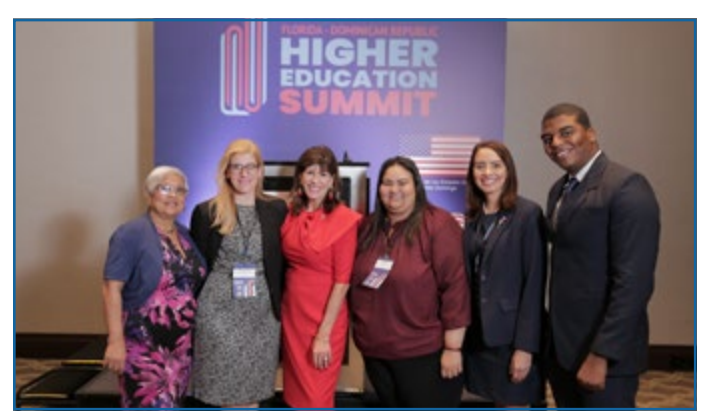
Ambassador Bernstein and participants of the Florida/Dominican Republic Higher Education Summit.