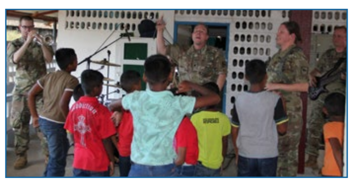
Army National Guard Band: Over 30 very talented musicians from the U.S. National Guard South Dakota were in Suriname to march in the National Day Parade in 2018. While here, they also had some public performances including at schools. It is part of the on-going relationship between Suriname and South Dakota.