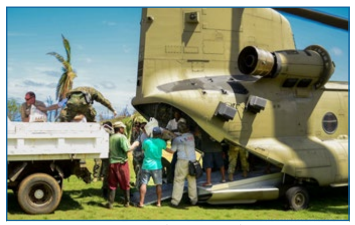
USAID delivers supplies to Dominica for hurricane relief.

U.S. assistance builds local capacity in the Caribbean to punish criminals who target Americans. Through recent Jamaican and U.S. interagency cooperation, authorities in Kingston extradited 18 people who were engaged in fraud schemes to steal an estimated $500 million per year, mostly from elderly U.S. citizens. Seven countries in the region have passed comprehensive civil-asset recovery laws with CBSI assistance, enabling them to investigate, freeze, and recover criminally-obtained funds and property of transnational criminal organizations. To enhance the efficacy of these efforts, the Department of State will introduce an initiative-wide monitoring-and-evaluation (M&E) system across the CBSI in keeping with a recent recommendation from the U.S. Government Accountability Office.