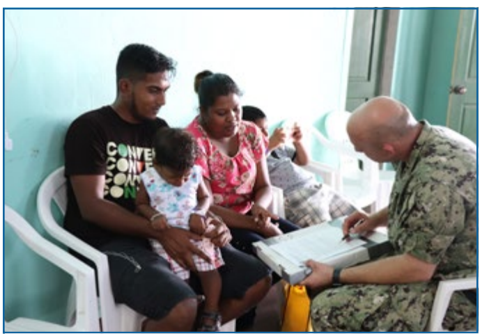
Assisting Venezuelan migrants in the Caribbean was one of the chief objectives of the 2019 USNS Comfort deployment to the region, pictured here in Trinidad and Tobago. Nearly 69,000 patients were seen during its mission, according to the U.S. Navy.

Through PEPFAR, the United States provides funding in Barbados, Guyana, Jamaica, Suriname, and Trinidad and Tobago to diagnose 90 percent of HIV positive people, ensure 90 percent of those diagnosed receive anti-retroviral therapy (ART); and suppress 90 percent of the viral load in patients on ART. PEPFAR has provided $25 million annually toward technical and financial assistance in the Caribbean: 21,808 patients were receiving life-saving anti-retrovirals at the end of FY18. In Jamaica, work with female sex workers contributed to a decline in the prevalence rate from 4.2 percent in 2011 to 2.0 percent in 2017. PEPFAR was key to the recent turnaround in Trinidad and Tobago's national HIV response. However, the region still falls short of international benchmarks. PEPFAR's Caribbean platform is regionalizing from Barbados to Jamaica.