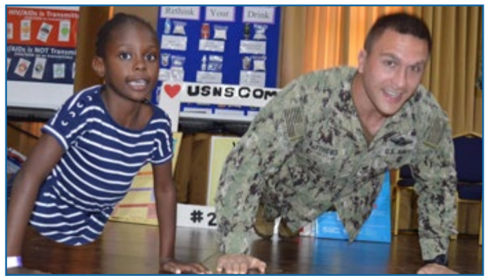
U.S. Navy Officer does push ups with a girl during USNS Comfort visit to Grenada.