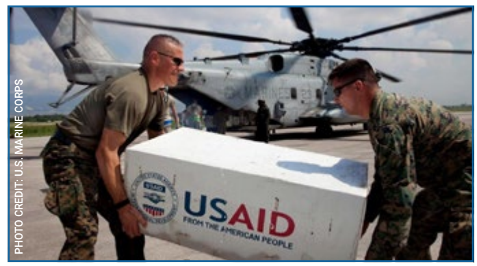
During the USAID-led humanitarian response to Hurricane Matthew in 2016, U.S. Southern Command stood up Joint Task Force (JTF) Matthew to quickly facilitate the movement of supplies and humanitarian personnel, conduct aerial assessments, and provide airfield operations support.

USAID/OFDA has regional advisors, specialists in managing the risk of disasters, information officers, communications officers, and on-call local surge-capacity consultants available for immediate deployment in the event of a disaster. These experts form the foundation of the USAID/OFDA-funded Regional Disaster-Assistance Program, which provides technical assistance and financing for disaster risk reduction and preparedness to national disaster organizations and first-responders throughout the region. When a storm is forecast to land in the region, USAID/OFDA can activate or pre-deploy local surge consultants, disaster specialists, a regional advisor, an assessment team, or a fully equipped response team, in consultation with U.S. Embassies in potentially affected countries as appropriate. USAID/OFDA continually replenishes stockpiled emergency relief suppliesincluding plastic sheeting for temporary shelters, watertreatment units, water containers, hygiene kits, kitchen supplies, and blankets-for rapid shipment from the USAID/OFDA warehouse in Miami to disaster-affected areas. USAID/OFDA also procures and stockpiles relief commodities locally when appropriate.